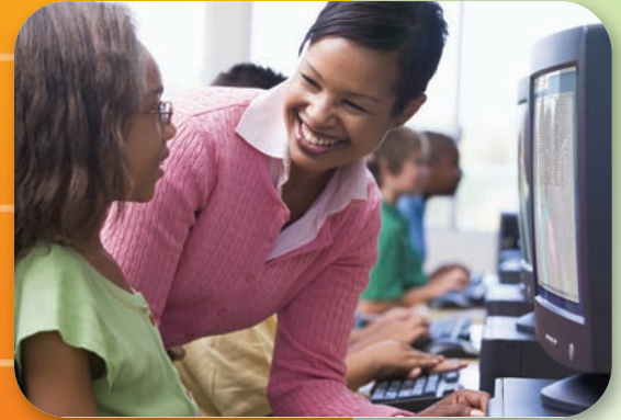
Data from Department of Education Georgia Report Card

African-American students at Early County Middle School have closed the achievement gap with math gains of 52 percentage points - from 28% to 80% of students who meet or exceed the standard.